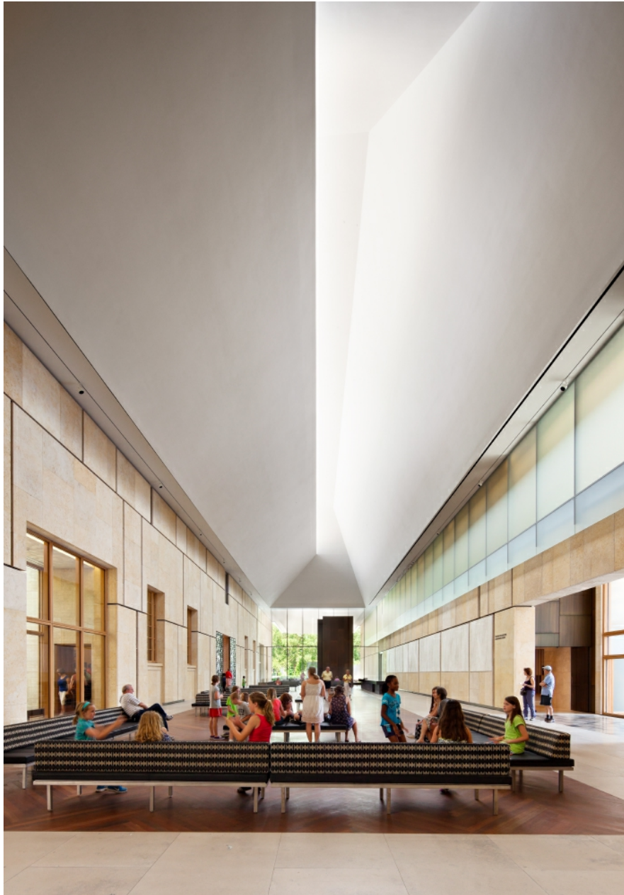
The light court of the Barnes Foundation.