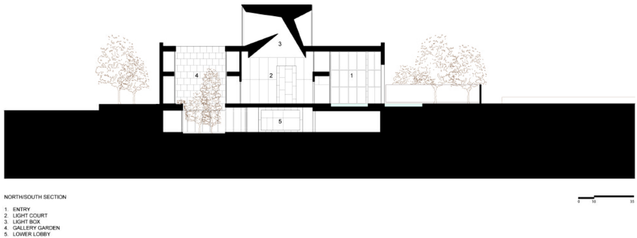
North-south section drawing.