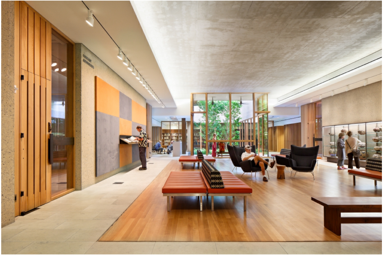
Inside the Barnes Foundation.