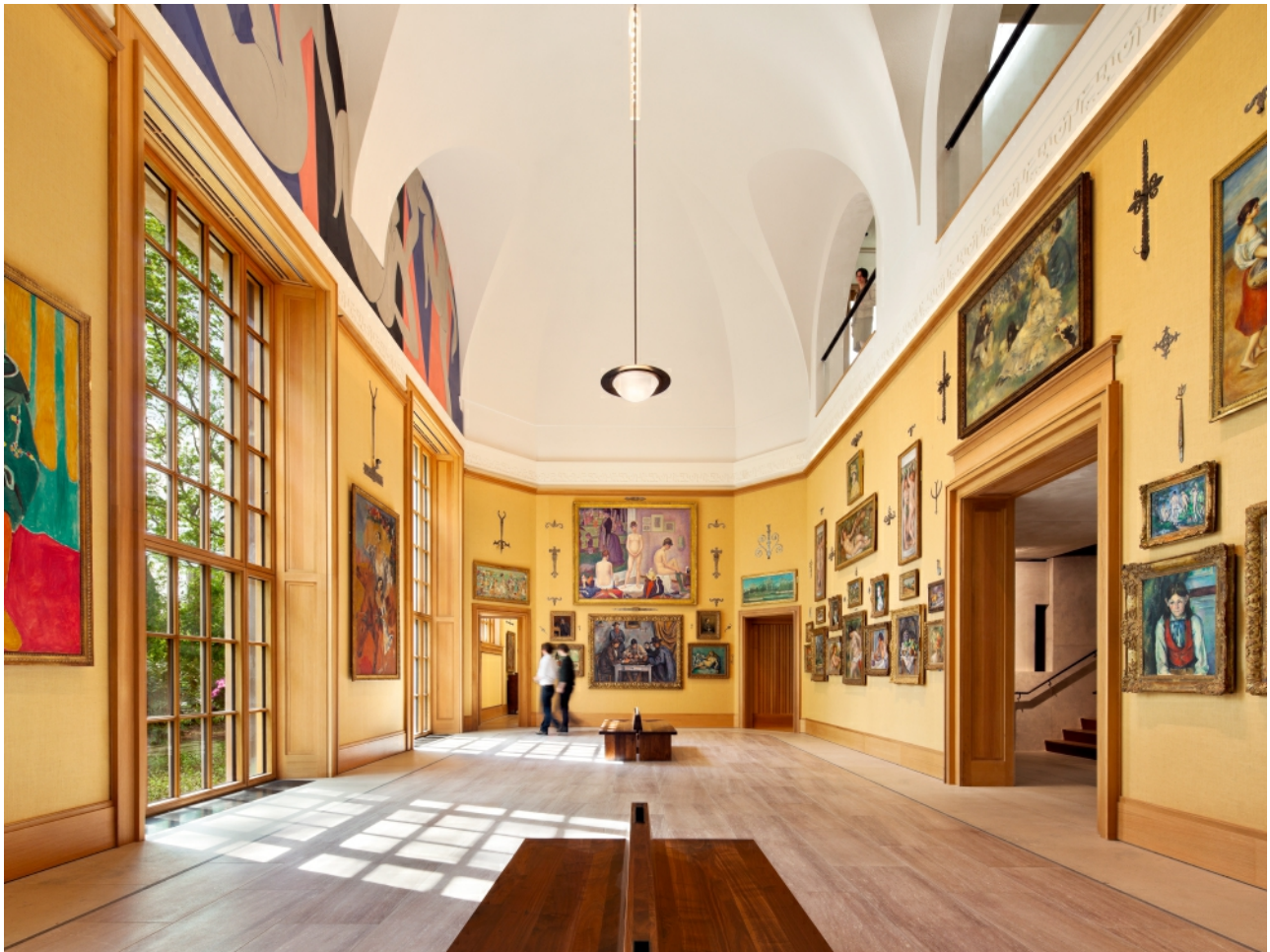
A gallery space of the Barnes Foundation.

The building form successfully resolves challenges of context, security, and materiality as it melds tradition with modernity.