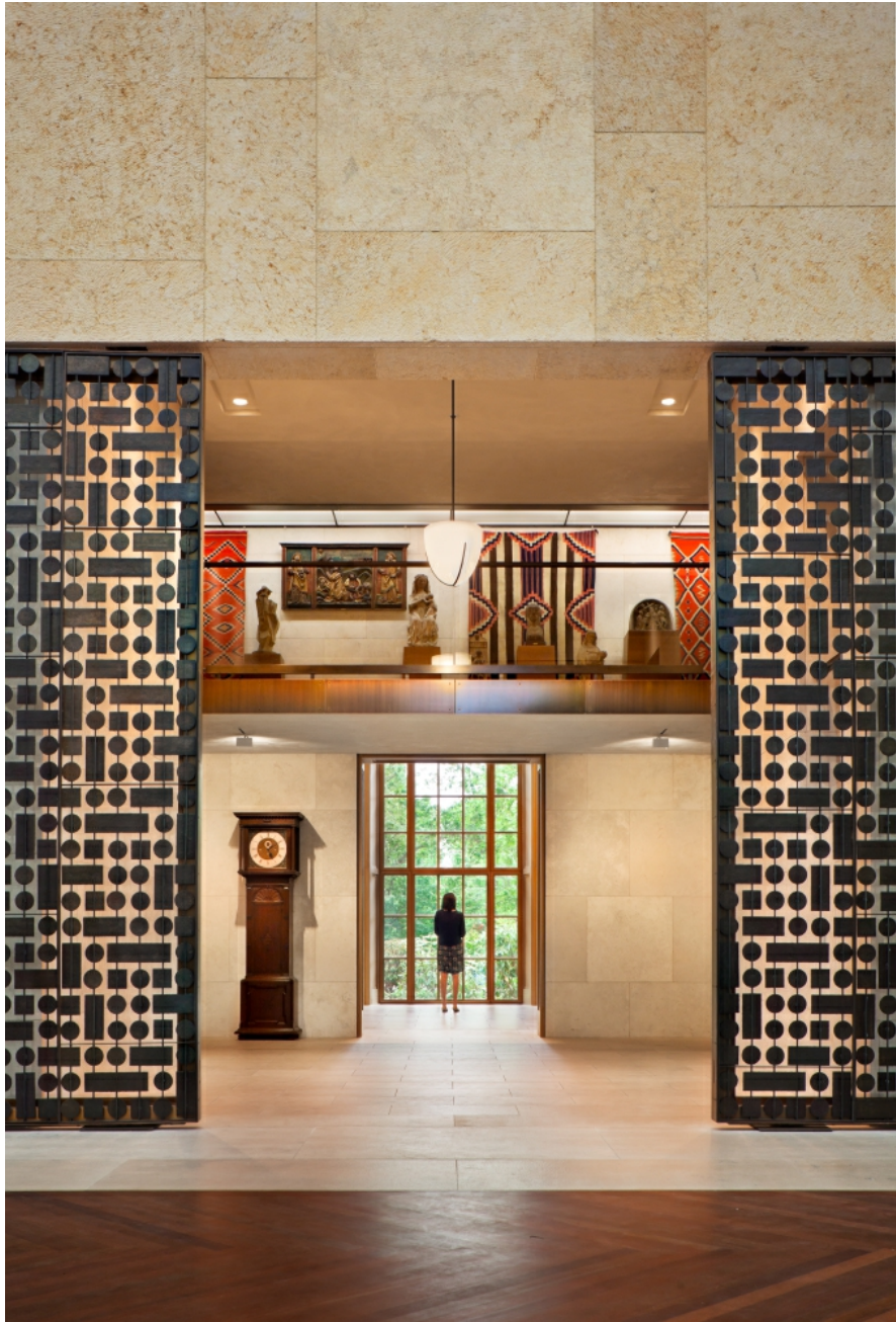
Gallery space.